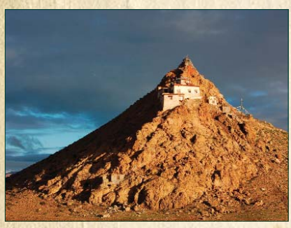
Tibetan monastery at sunrise