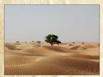
Serenity of the Taklamakan Desert