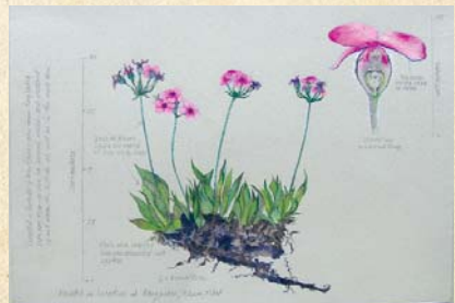
Kham wildflower illustration by Dianne Agaki

To expand the documentation of regional wildflowers, Dianne began the first botanical illustration classes in Gansi to benefit local villagers and expand the horizons of children living at the Gansi Girls' Orphanage.