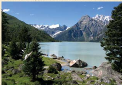
View of Yi-Lhun Latso, a sacred lake near Manigango