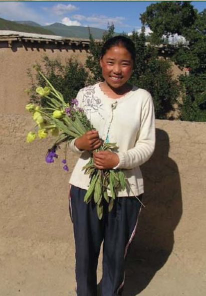
Young Tibetan holds bouquet of Meconopsis integrifolia