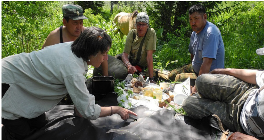
Arita creating her own map on animal skin matching the natural sacred spaces with their importance to indigenous culture

travel with an open mind and ‘think’ with the senses.