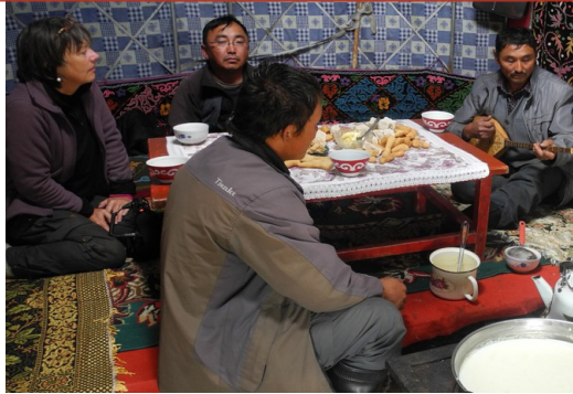
Arita discussing native culture and events with the local people

Horses were not permitted to cross international borders, so the team had to rent different horses from different contacts in each country. At each border crossing, horses, translators and fixers had to all be present at a specified time with all travel documents. If just one expedition element missed the appointed border crossing time, the entire expedition could be compromised. The biggest challenge was to