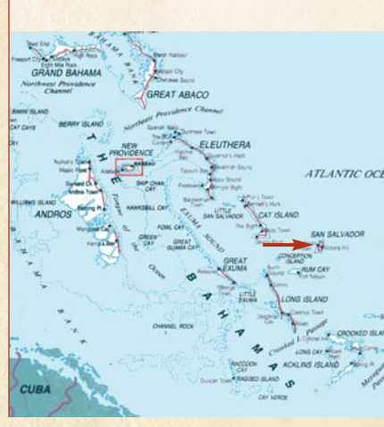
San Salvador, the site of Stephanie's cave exploration, is one of 700 islands in the Bahamas.

To understand how extensive underwater caverns were created