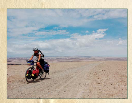
Mel cycling on the open road of Xinjiang Province