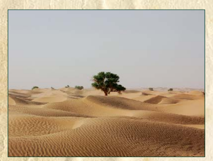
Serenity of the Taklamakan Desert