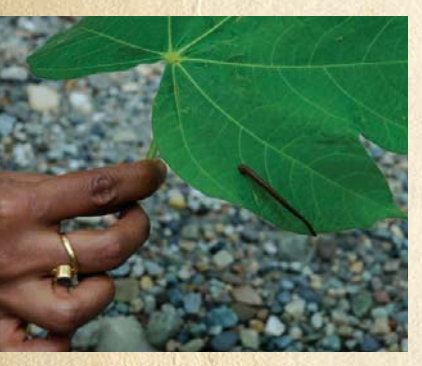
Top: Gita's research vehicle containing grassland samples from a day's work.

Middle: Montu, Shyamal, and Gita temporarily seek shelter from alarmingly close wildlife.