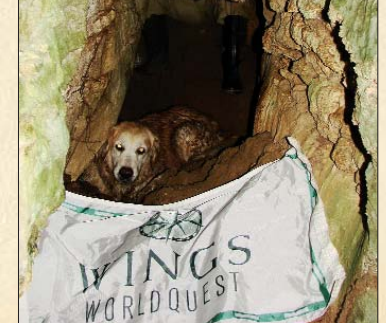
Skywalker with Wings WorldQuest Flag #3