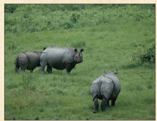
Above: Three of the 108 rhinos that live within Jaldapara Wildlife Sanctuary, one of the five remnant herds in India.

West Bengal Forest Department, India Jaldapara Wildlife Sanctuary, India, Wildlife Institute of India, India Columbia University, U.S.A. Wildlife Trust, U.S.A.