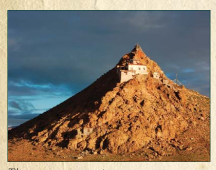
Tibetan monastery at sunrise