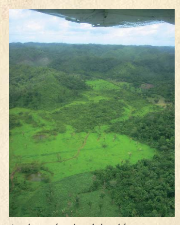
Aerial view of roads and cleared forest

The danger encountered in trapping the top predator of the jungle pales in comparison to the dangers of working in a region with rampant and violent drug trafficking. Vast deforestation of the Central American jungle and the construction of roads into pristine wilderness are causing massive disruption to the environment, and the capture of endangered animals is widespread. Organizations such as ARCAS (Asociación de Rescate y Conservación de Vida Sivilestre) rescue, rehabilitate, and reintroduce hundreds of wild animals confiscated from illegal traffickers. Fighting for the ecosystem and meticulously documenting the changes they see, Dalia and her team continue to push forward in spite of the devastation, violence, and disorder.