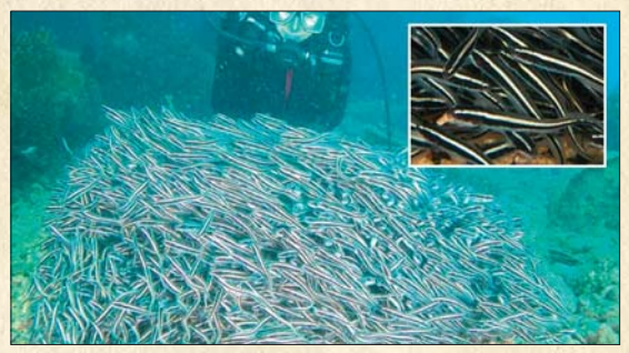
Juveniles congregate 7.3 meters under Samarai Dock.

swarming as they return each day, moments before sunset, to rejoin their parents, who maintain the tunnels but are rarely seen.