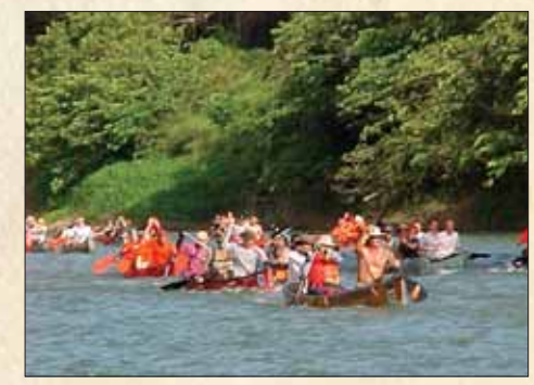
Some of the 88 teams on their way to Belize City in the 2005 Ruta Maya Belize River Challenge

Paddlers traveling at a leisurely pace could view Belize's wildlife: tapirs (the national animal), black howler monkeys, iguanas, keel-billed toucans, silky anteaters, otters, margays, ocelots, fish, manatees, and dolphins. A profusion of orchids, bromeliads, butterflies, and birds added to the exotic