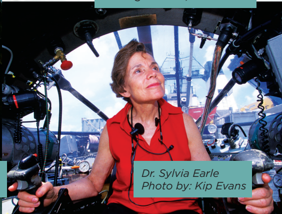
Dr. Sylvia Earle